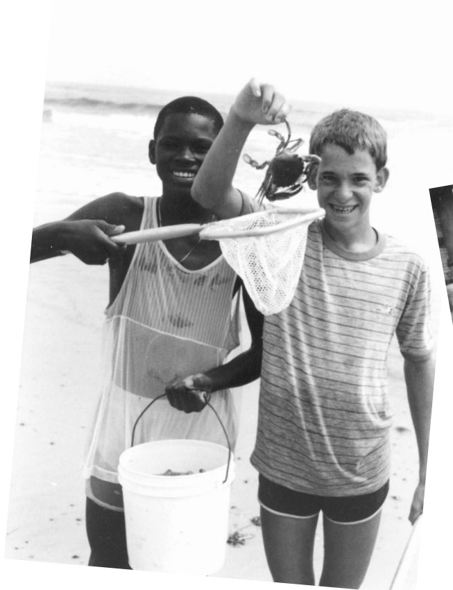
ISLAND BEACH STATE PARK